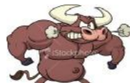
See youse, Pal....