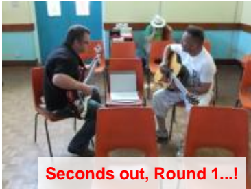
Seconds out, Round 1...!