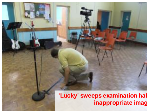
'Lucky' sweeps examination hall for 'bugs' and inappropriate images

It's a little known fact that all NI Shadows Club meetings are recorded for evaluation by Headteacher. All filming is undertaken by local flying ace, Mr Charles 'Lucky' Lindbergh