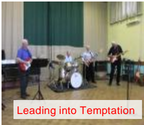
Leading into Temptation