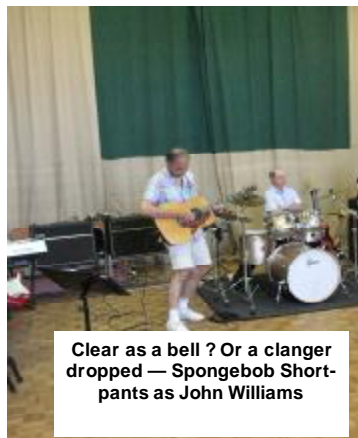
Clear as a bell ? Or a clanger dropped — Spongebob Short-pants as John Williams

A little known fact : a Carillon is a church-tower containing over 23 tuned bronze bells weighing some 100t. Being extremely loud, the only thing to match it in volume is a Saturn rocket (or McNeill's bass amp at level 13)