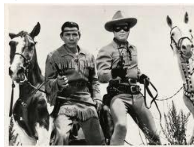
Tonto, who was (allegedly) from the Potawatomi tribe and thus was neither an Apache nor called Geronimo. He also had a pushy PR Agent.