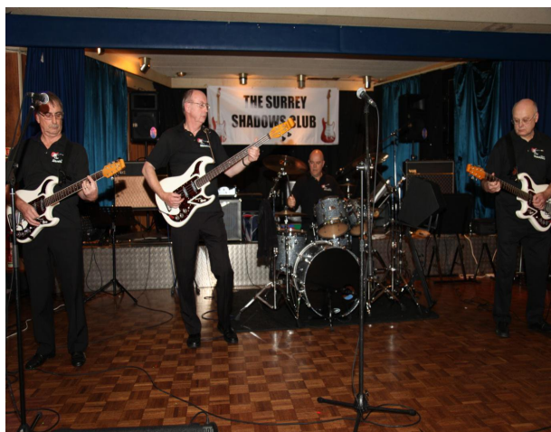
The Silver Shadows

We are most grateful to them and just know it's going to be a superb evening at the Club in October.