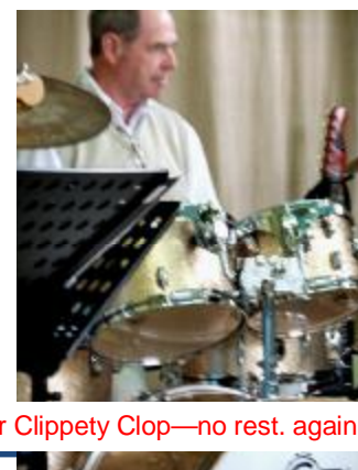
Mr Clippety Clop—no rest. again..