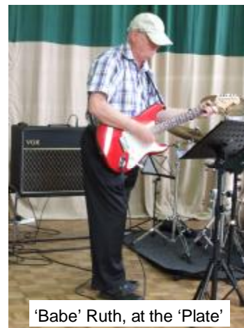
'Babe' Ruth, at the 'Plate'