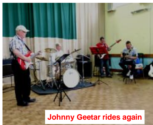
Johnny Geetar rides again

Next Club Day : Sunday 6th October 2013—don't forget your playlist requests to The Godfather IN GOOD TIME !!