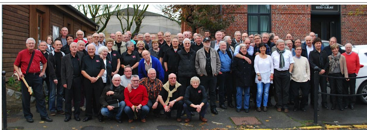
Ch'tishads group photograph