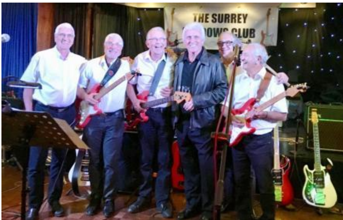
Shotgun Ltd with Bruce Welch

Shotgun Ltd played a selection of tunes including, Going Home Walk Don't Run, Guitar Tango, Sound of Silence, Equinox V, Some Are Lonely, Return to the Alamo Mountains of the Moon.