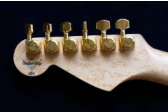
The Autograph Headstock (Rear)