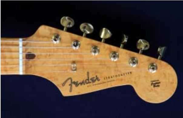
The Shadows 50th Anniversary Headstock (Front)