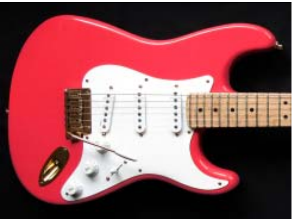
The Autograph Body