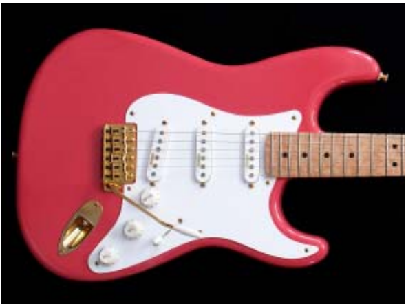
The 40th Anniversary Body