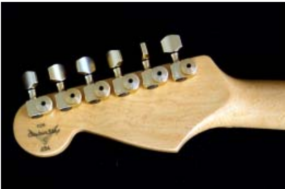
The Signature Headstock (Rear)