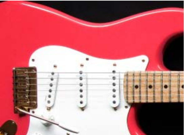
The Autograph Body and Pickguard