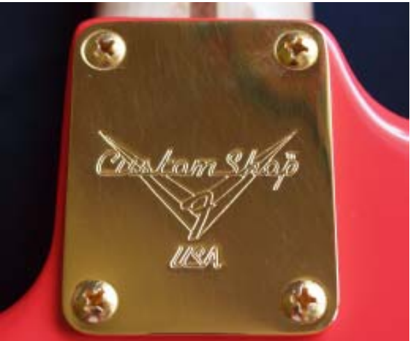
The Autograph Neckplate