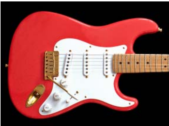
The Signature Body