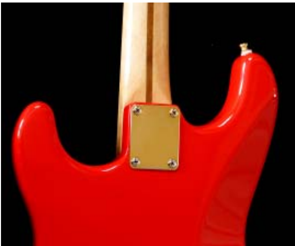
The Signature Neckplate