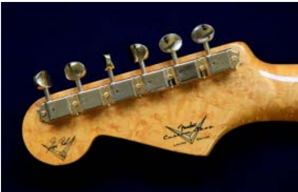
The Shadows 50th Anniversary Headstock (Rear)