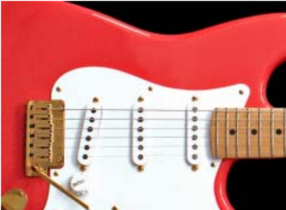
The Signature Body and Pickguard