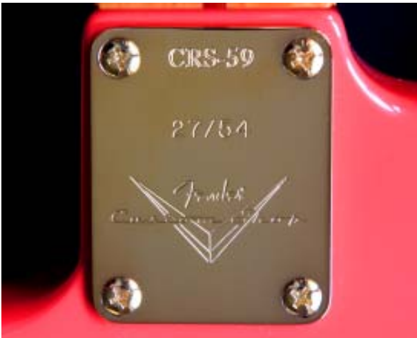
The Shadows 50th Anniversary Neckplate