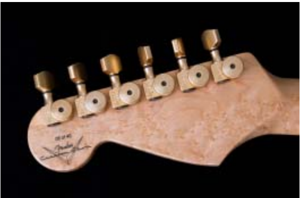
The 40th Anniversary Headstock (Rear)