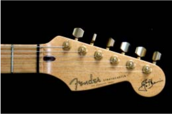
The Signature Headstock (Front)