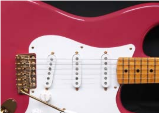
The Shadows 50th Anniversary Body and Pickguard