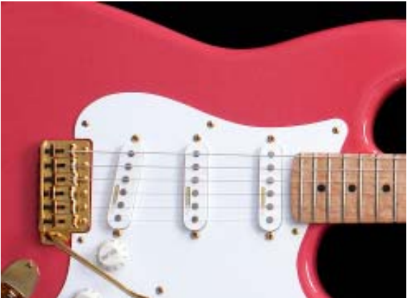
The 40th Anniversary Body and Pickguard