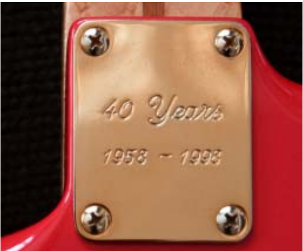
The 40th Anniversary Neckplate