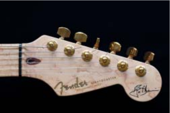
The Autograph Headstock (Front)