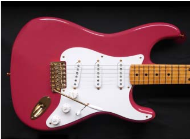
The Shadows 50th Anniversary Body